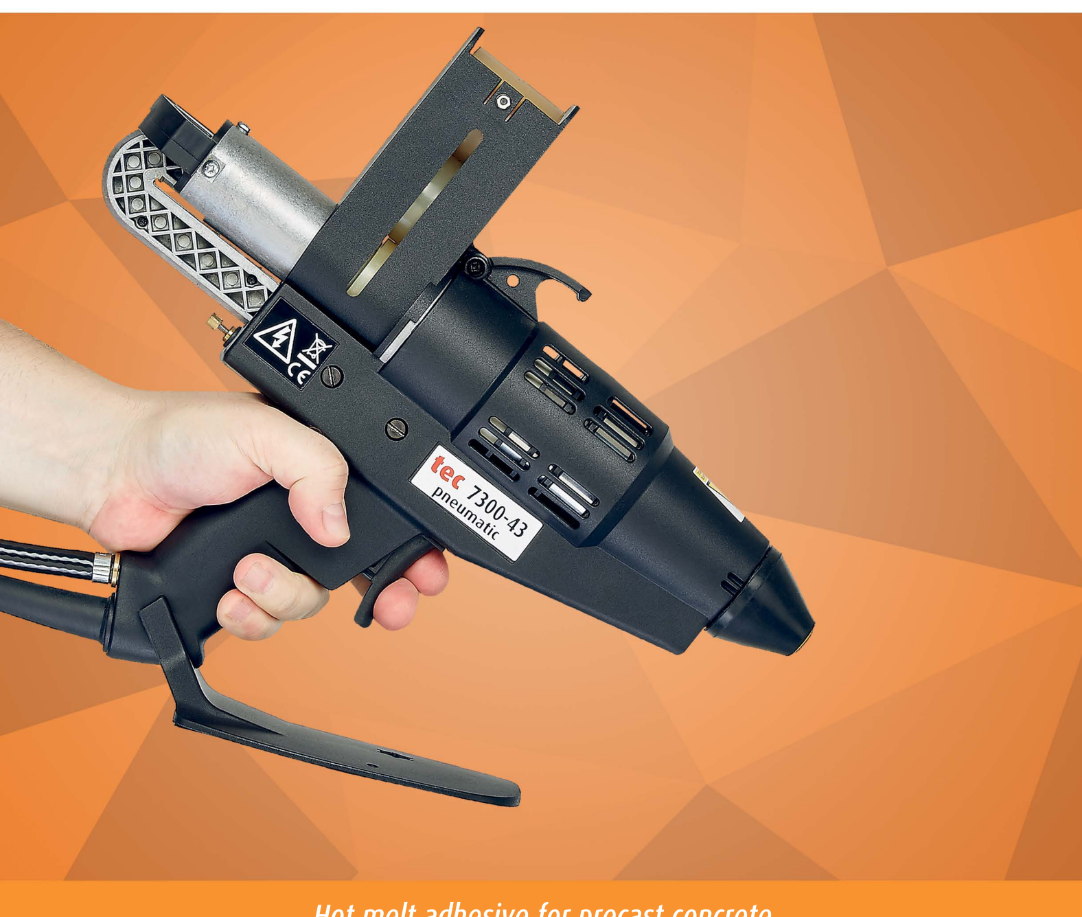
Hot melt adhesive for precast concrete